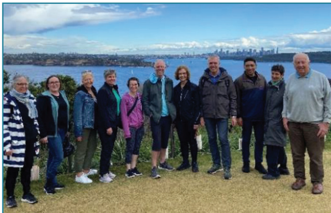
Manly Bike Riding Group