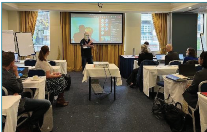
Welcome to country